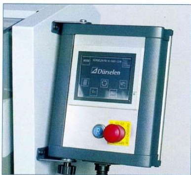
PB.16: Easy programming and machine status indication

Both sliding tables feature an integrated drill belt as a bed. Output rates for spiral and twin wire binding exceed punching methods by processing piles of 50 mm \times mm up to \times mm in a single pass.