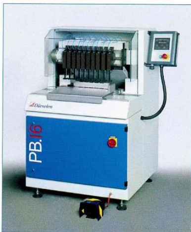
The optional motorised sliding table and extended back table with programmable back stop are all touch screen controlled.

The programmable sliding table and back stop have an icon driven touch screen - easy-set menus for quick programme writing with the built-in error checking menu to trap and eliminate possible problems.