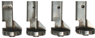
Suction blades for Countron Touch, T-350, Twin and Eye II.