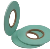
Inserting tab tape for Countron series.